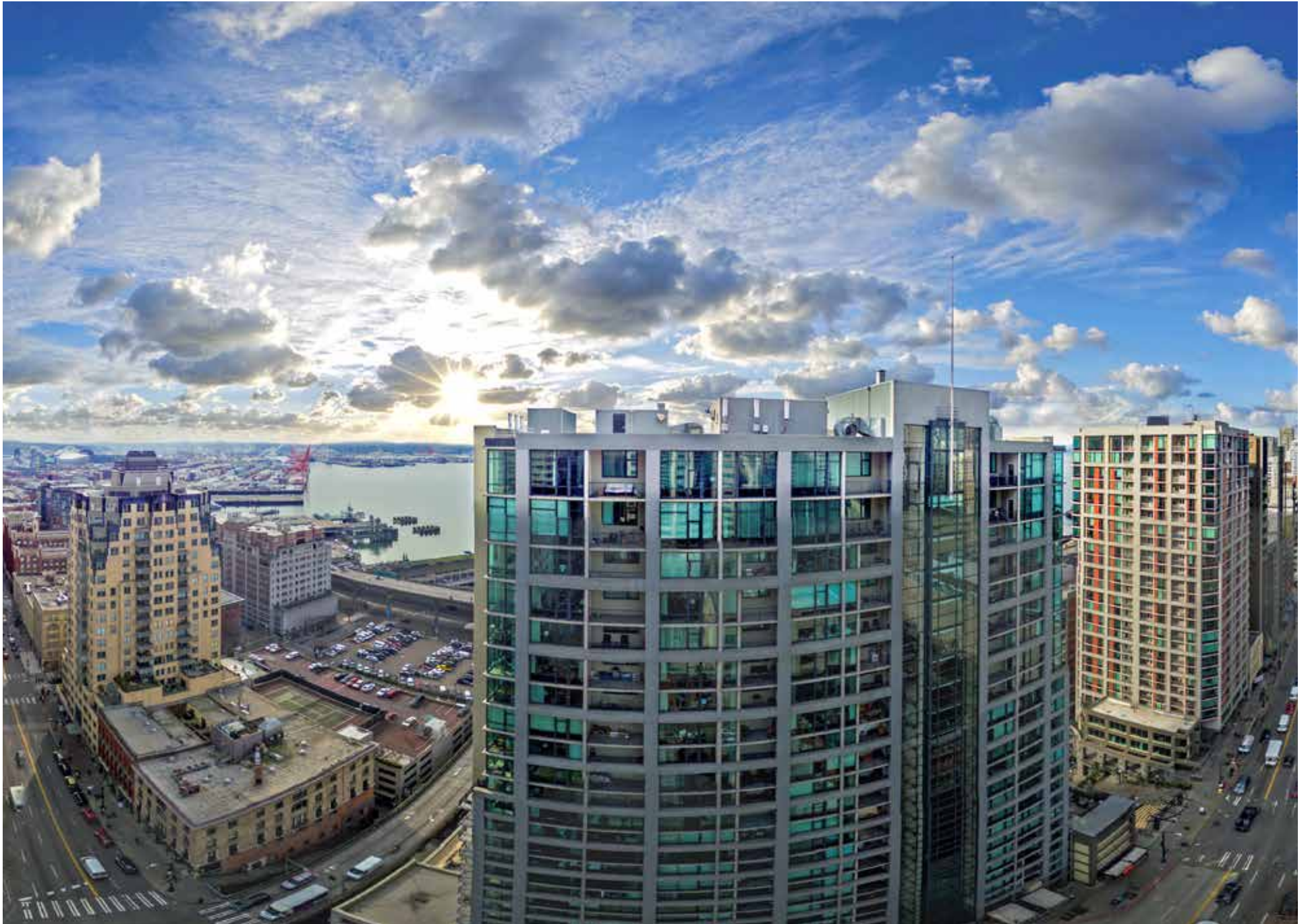
LOOKING WEST FROM LEVEL 19