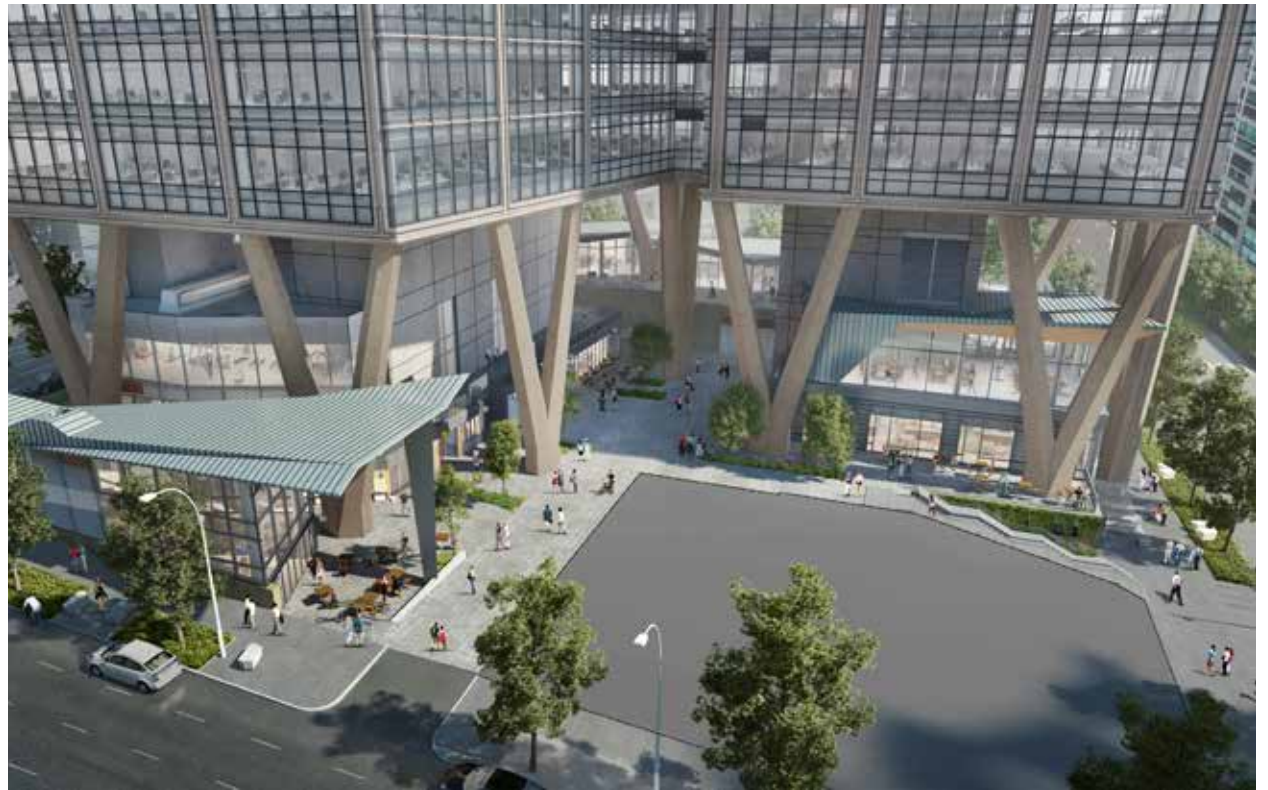
VIEW INTO THE PLAZA