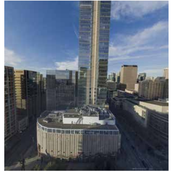
LOOKING NORTH FROM LEVEL 19