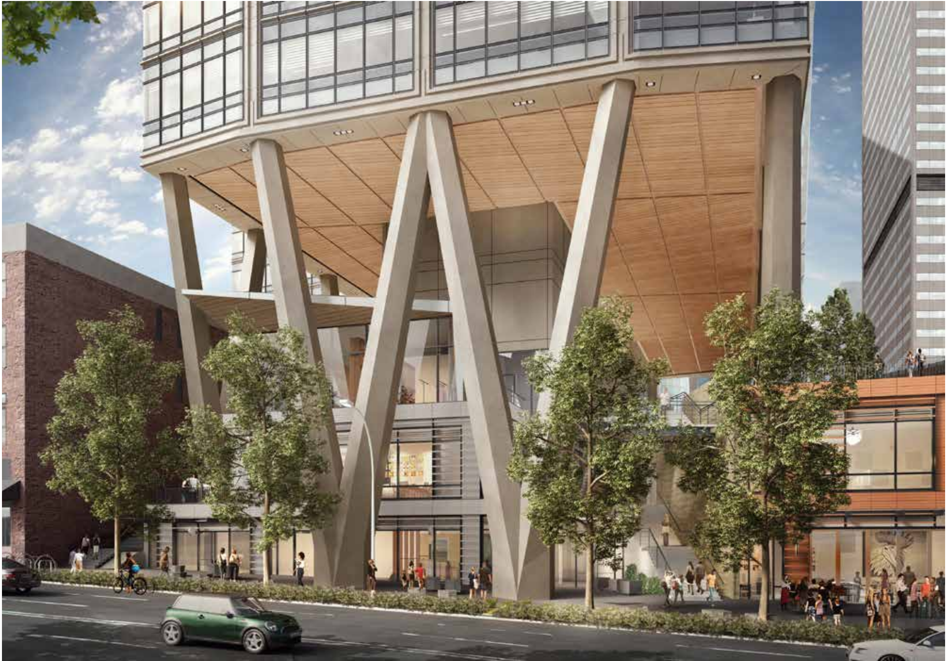
LOOKING EAST FROM 1ST AVENUE