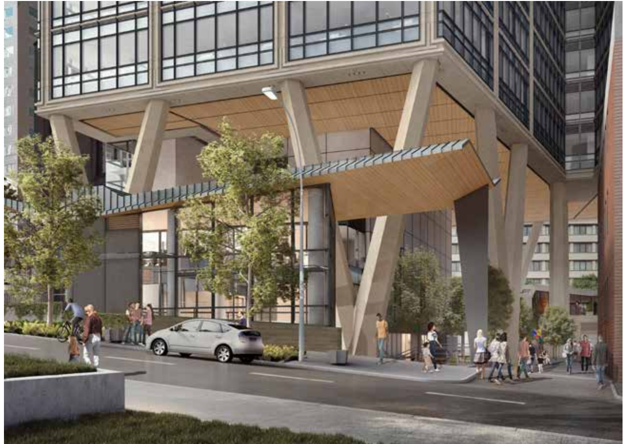
UNIVERSITY STREET LOOKING SOUTH